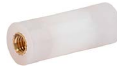
Transpillars Style 3